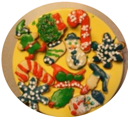
Lizzy got a cookie-making day started.

Many thanks to Bob Maloney who printed a collection of the pictures taken over the past year. They are displayed in the entry way. It is great fun to see all the adventures we were on.