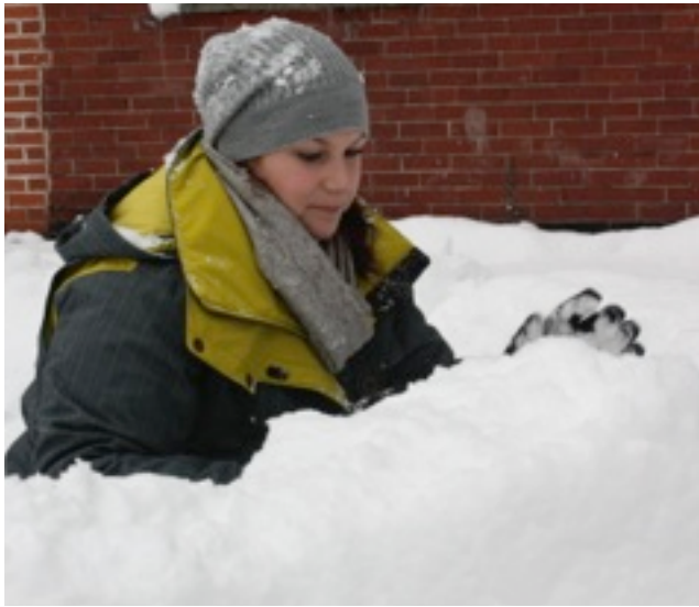
This is our kind of snow day when we get to play in the snow, be with our friends, and use our imagination to create shelters.