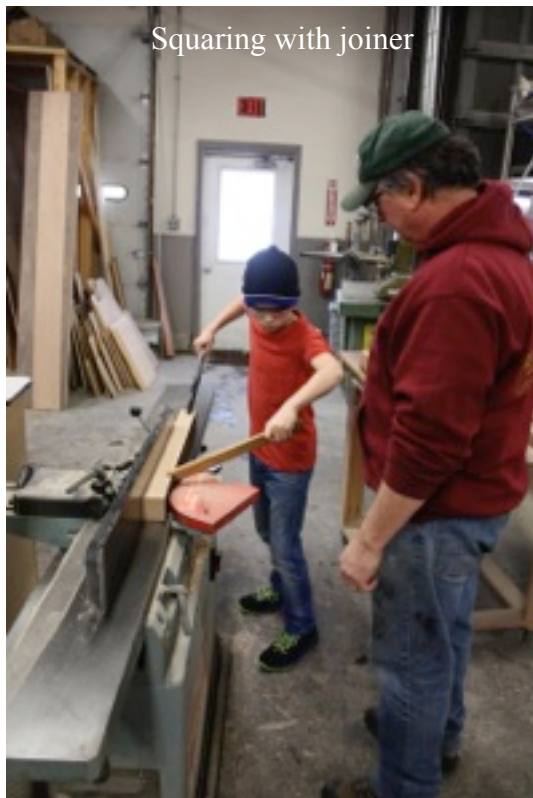
Squaring with joiner

We are lucky to have a parent offering an internship to our students. They are building two harvest tables for our dining room from red oak. Students have used a chop saw, sander, planer, traditional joiner, and biscuit joiner.