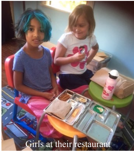
Girls at their restaurant