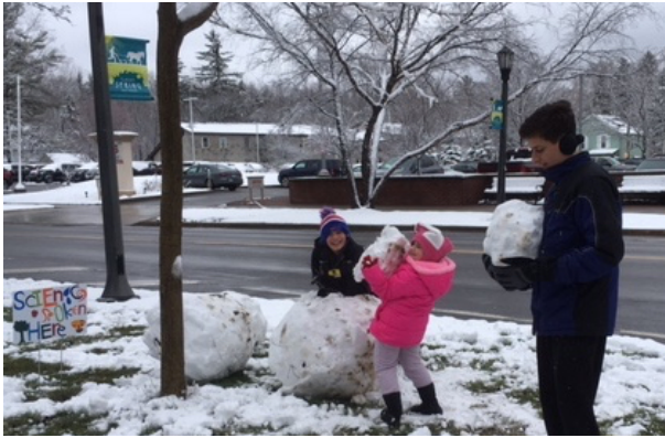
Scientific exploration of precipitation, compaction ratios, and mass:volume relationships.

Mandala School is a haven from the stresses of Common Core and other bureaucratic impositions. Here students can learn alongside older and younger children, explore their interests, and have a great amount of fun. In turn they become competent and confident about reading, writing, mathematics, art, speaking, and diplomacy.