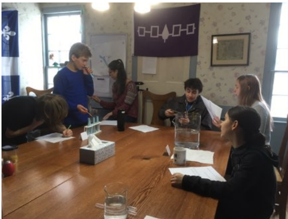
Mini Science Fair: Why does something float? How well can you identify a scent? How many drops of water will fit on a penny?