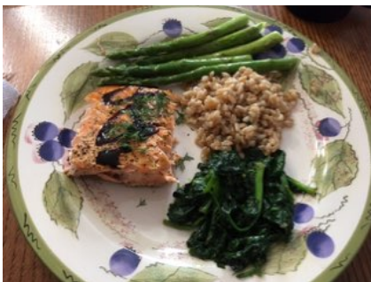
Special lunches are chosen by the wise and daring. Liza prepared Friday's lunch of salmon, spinach & garlic, farro, and asparagus followed by salad, Oma cheese & baguette, grapes, and watermelon. Très bien!

Current assignments 1900s History report Groups are each doing a chosen decade Study French!