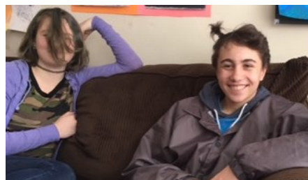
The fashion-conscious experiment with hair styles.

Current assignments 1900s History report Groups are each doing a chosen decade Study French!