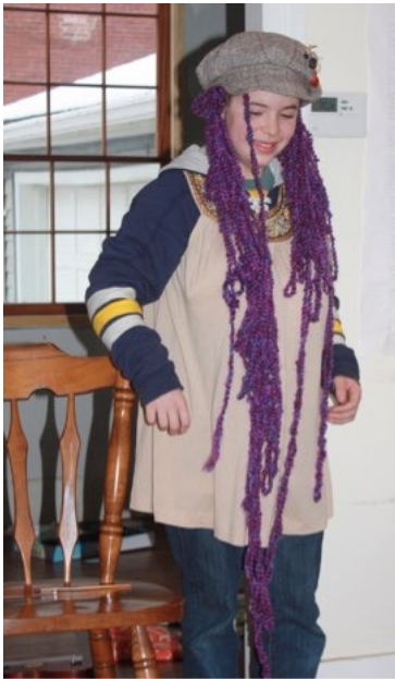
Presentations can be fun!

The upper group is practicing algebra concepts such as combining like terms, factoring, and multiplying binomials. Some are solving systems of equations and simplifying radicals.