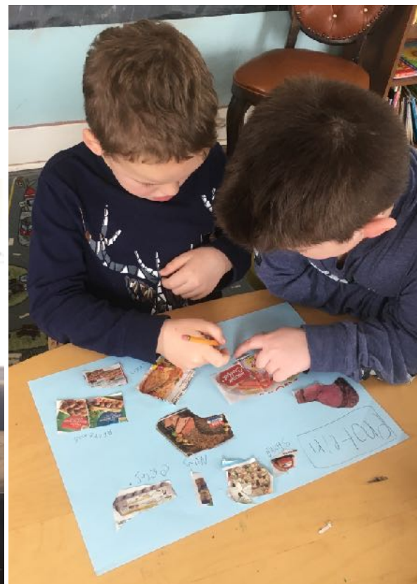
Younger students made posters representing different food groups that we should have daily: protein, fruit, and vegetables.