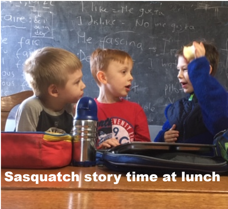
Sasquatch story time at lunch