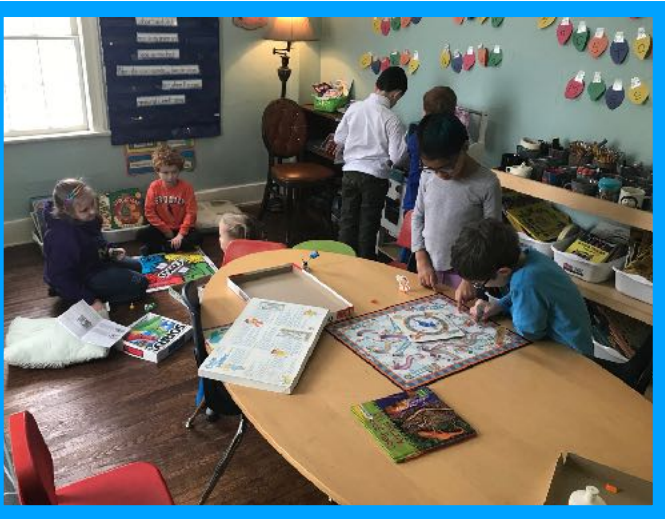
Playing board games on a cold day