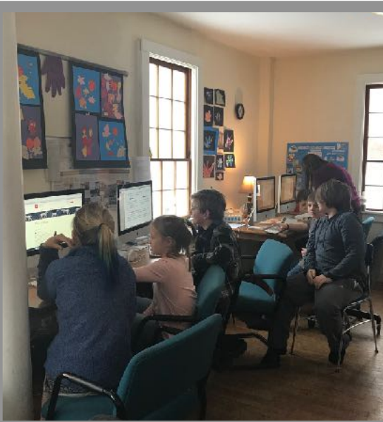
Students working on their ancient civilization research project. They are studying different aspects of life between 2000 and 1000 B.C.