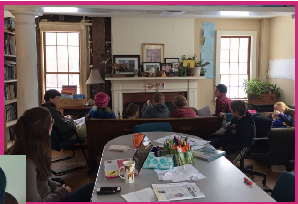
Above: Students gathered around the fireplace reading short stories by Ray Bradbury. We started a science fiction unit reading The Pedestrian and All Summer in a Day . Students are beginning to write stories of their own.