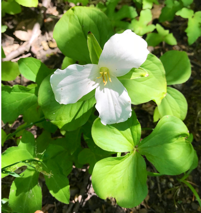
A single trillium at Sinking Ponds