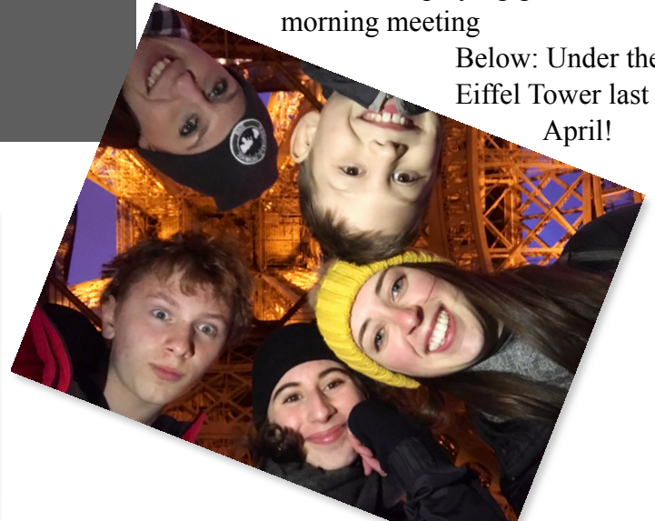
Below: Under the Eiffel Tower last April!