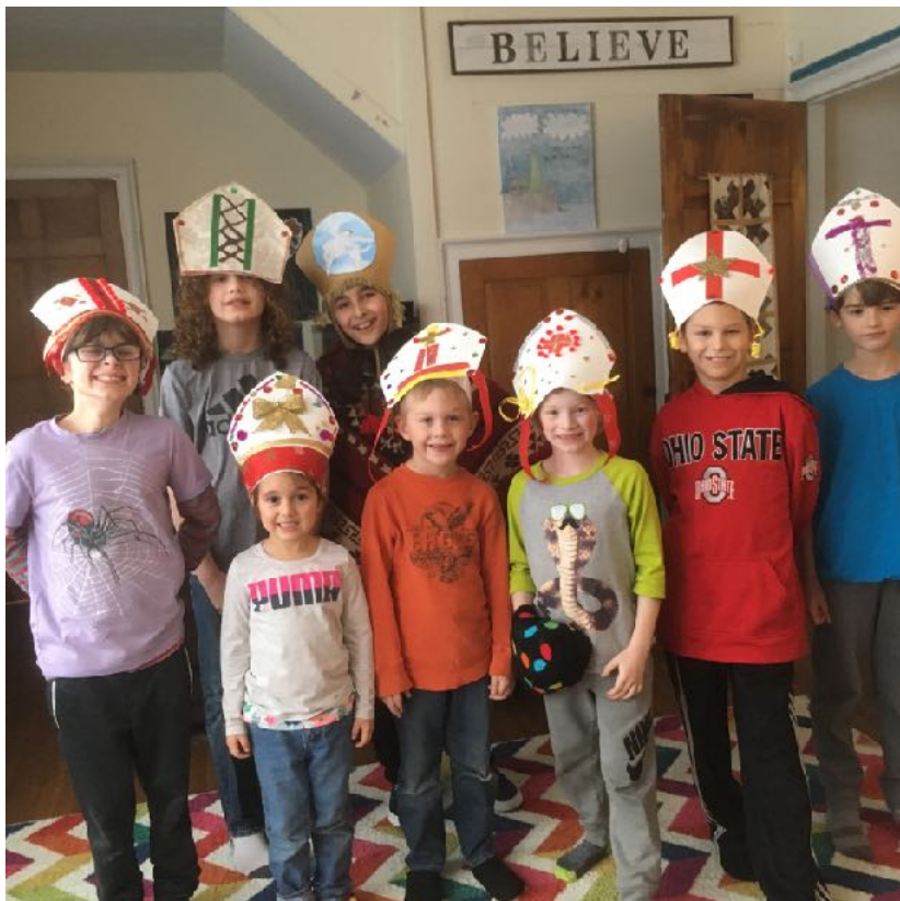
Bishop hats for St. Nicholas Day