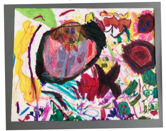
Dark Star by Graham