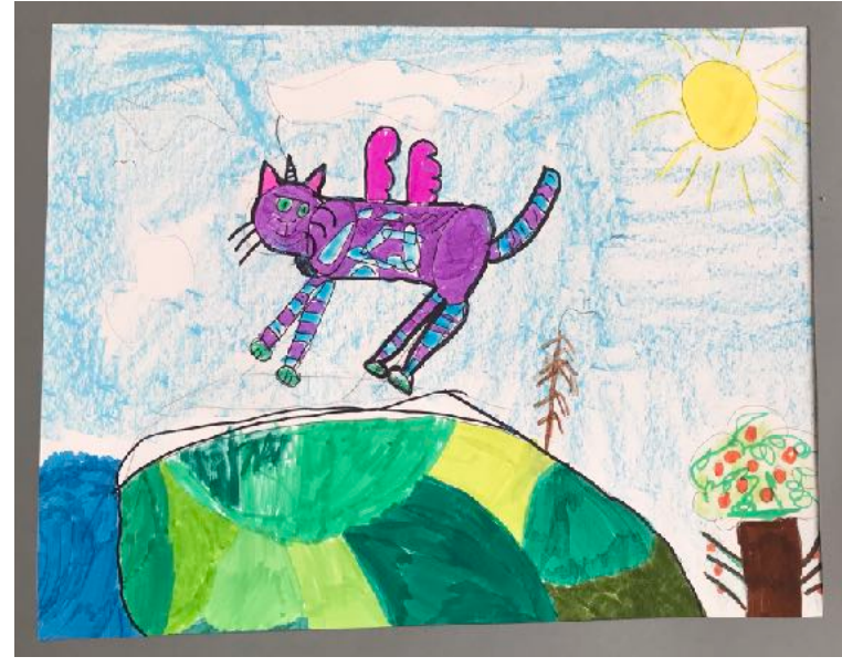
Flying Cat by Sia