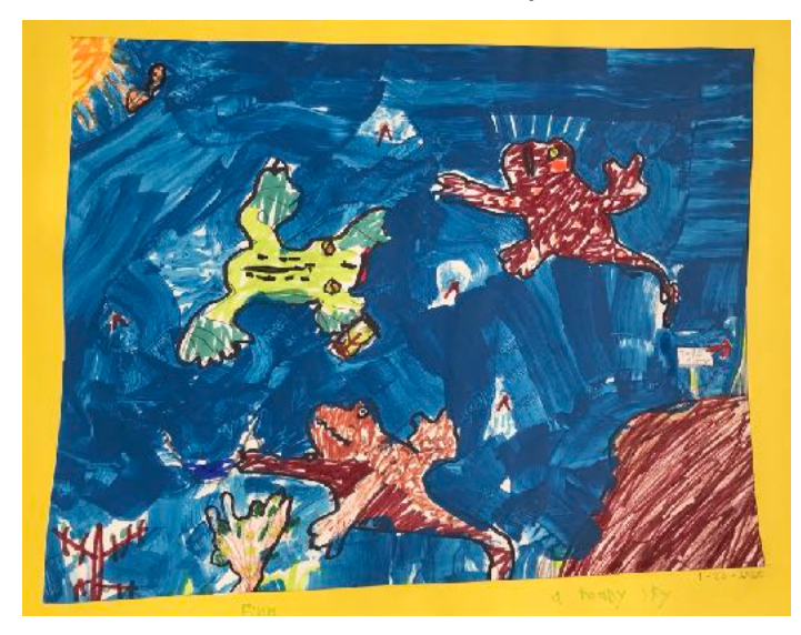
A Toady Sky by Finn

Chagall brought out magic in the youngest group! The students' surrealistic art is displayed in the Mandala Meeting Room, please come take a look!