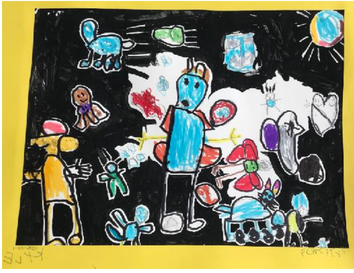
Fox City by Kyle