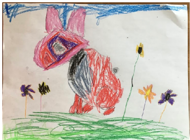
Ama's drawing from art class this week, students remembered Dusty.