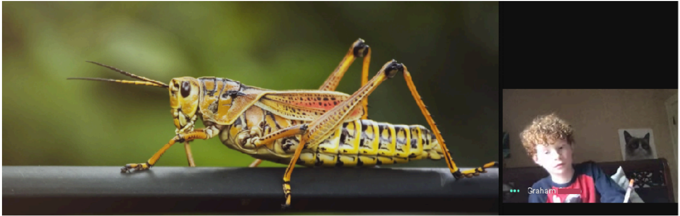
Graham working on his drawing of the Eastern Lubber Grasshopper