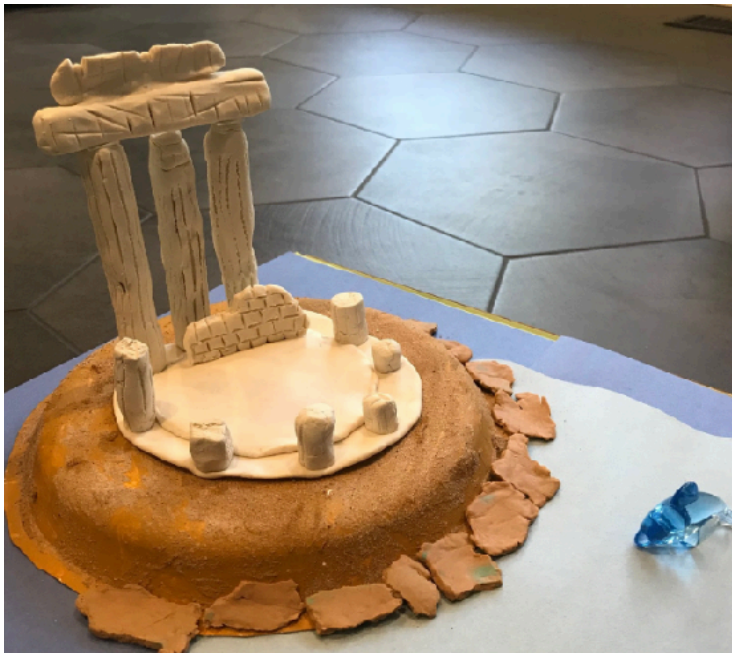
Top: Kate's ice cream cones