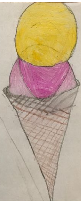
Bottom: Sachin's ice cream cone