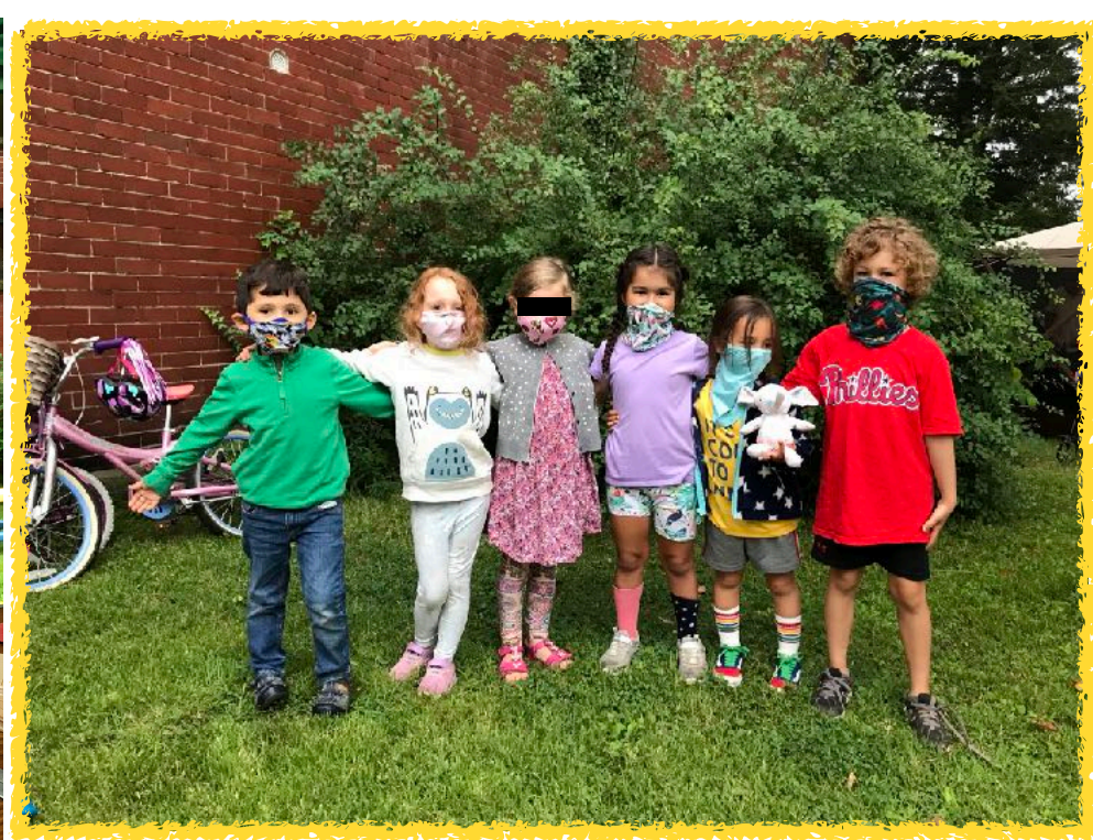
Our 2020-2021 kindergarteners