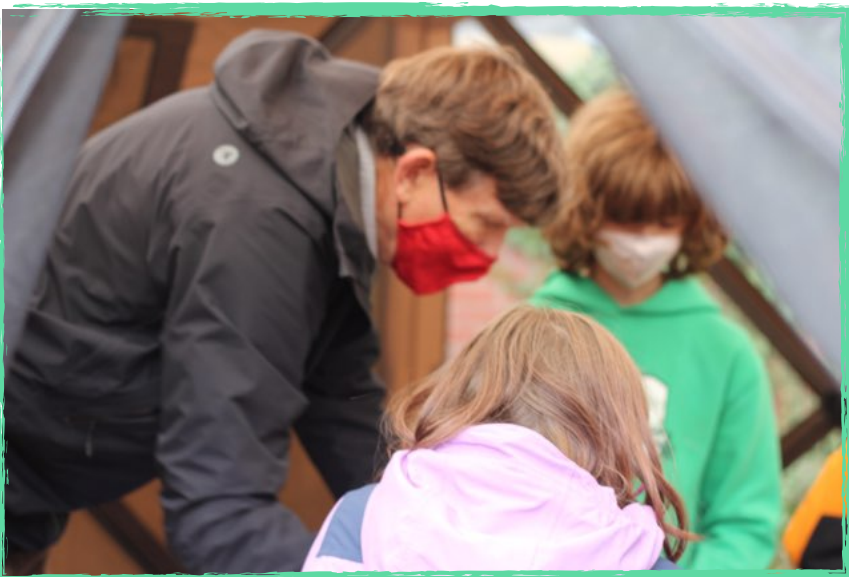
The finished results of the little kids' spider webs!

Art- this week in art we made spider webs. First we had to put tape in the shape of the spider web. Next we had to painted on the black paper. I made mine yellow and blue. And then we made spiders to go with it. We used black paper and then you could add any color pipe cleaners to make the legs. by Elena