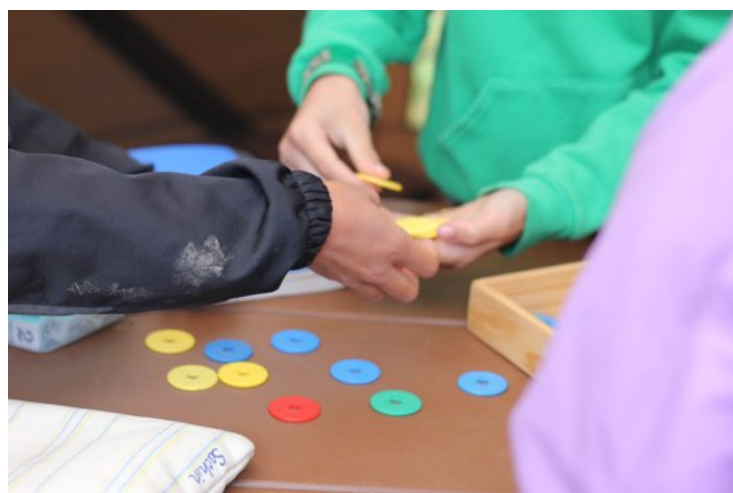
Sachin & Finn playing The Trading Game

5 yellows = a blue 5 blues = a green 5 greens = a red 5 reds wins!