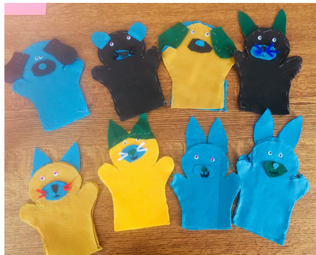
(below) The puppets all finished! They are currently working on a stage for puppet shows.

Before break we had a presentation about The Chinese New Year to celebrate the new year in China. We learned two songs. The songs are, 中国新年 Zhōng guó xīn nián ( The family song ) and 家庭歌 Jiā tíng gē ( the new years song ).