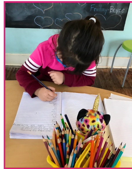
Starlight writing her sight words