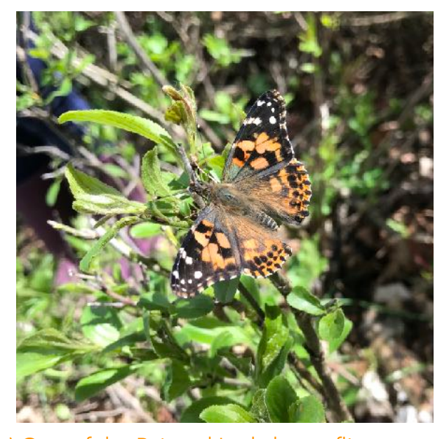
(Up) One of the Painted Lady butterflies resting on a plant. (Right)

One of the Painted Lady butterflies being released. We fostered these butterflies at school since larva. We set them free this Monday!