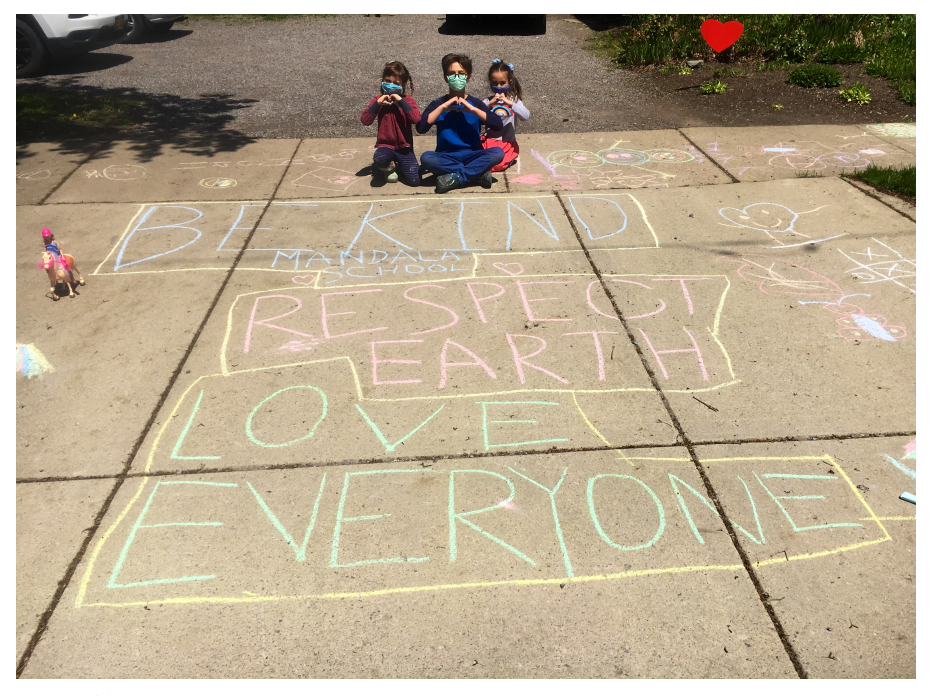
Zachary's message to everyone!