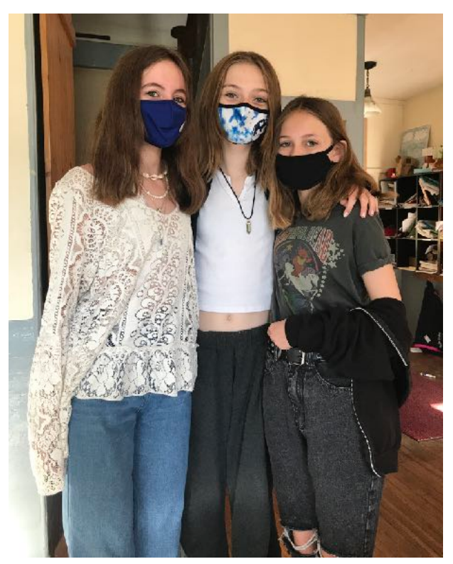
Smiles on Friday