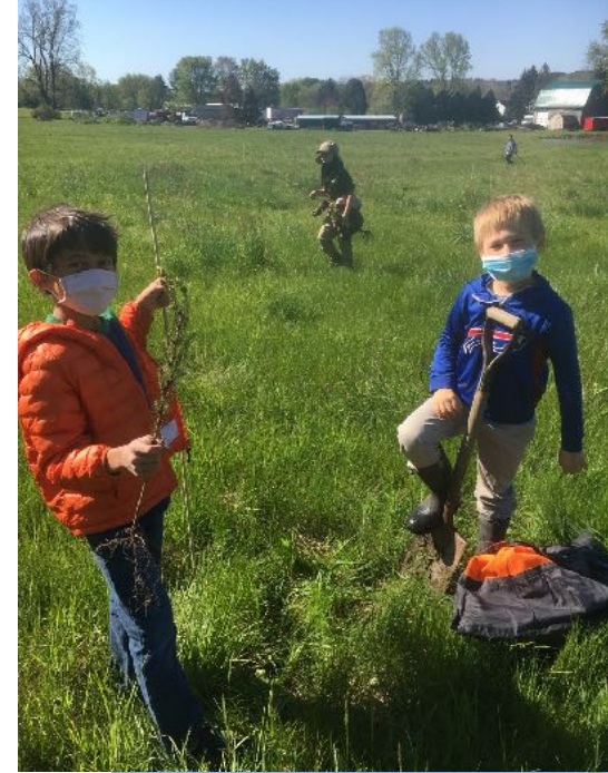
T S ir e: