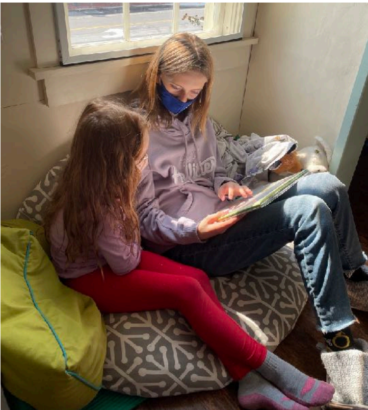
Older students reading to younger students

I had to keep saving them during the rainstorms. I thank myself 9,000,000 times for putting a plant in their habitat as they can climb on the plant when their tank is flooded. I hope I can use them for the other animals I keep.