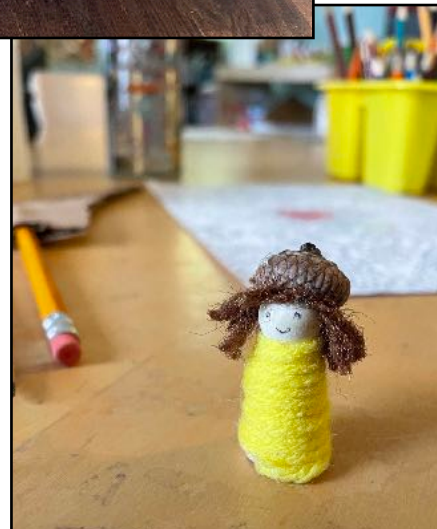
Ama's Super Baby acorn doll from art class.