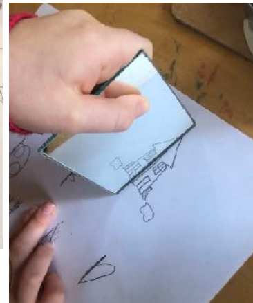
The youngest students experimented with mirrors to learn about symmetry!