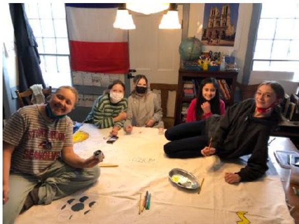
Girls at Girl Club working on a banner. We found powerful, inspiring quotes to paint on it. We will hang it in the school.

Right: Ms. Leah set up a demonstration to show half-life. The radioactive decay of elements like Carbon-14 can be used to date fossils, rocks, and archaeological artifacts.