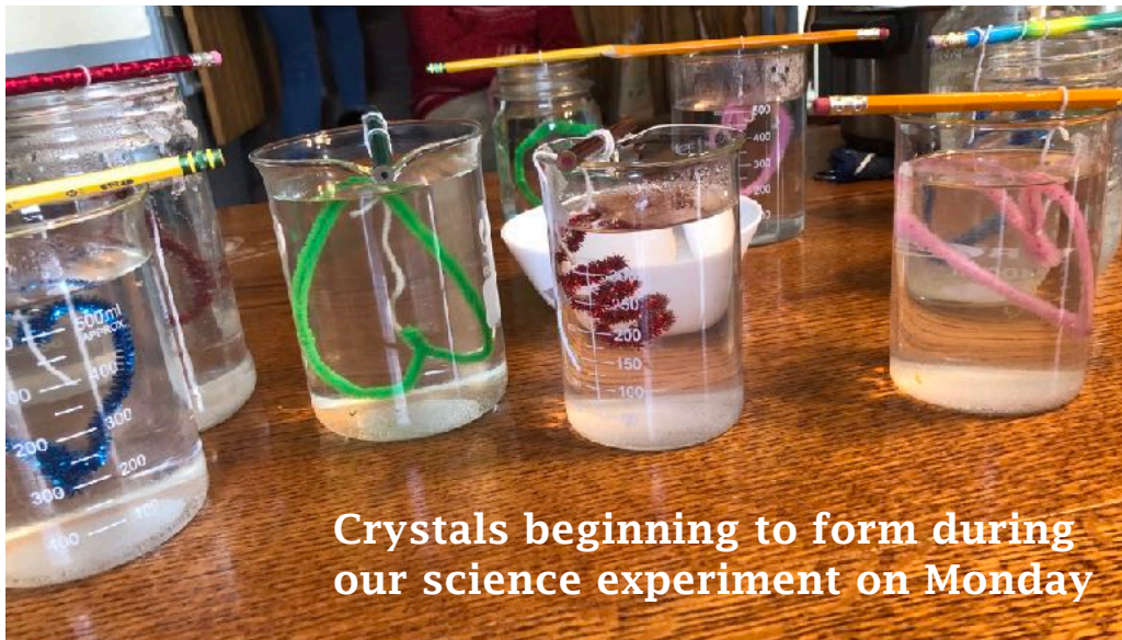
Crystals beginning to form during our science experiment on Monday