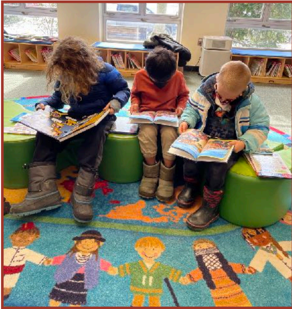
Boys in boots with books!