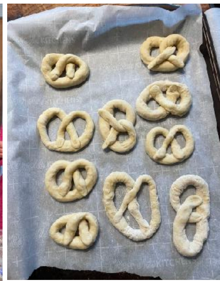
🥨 making pretzels 🥨