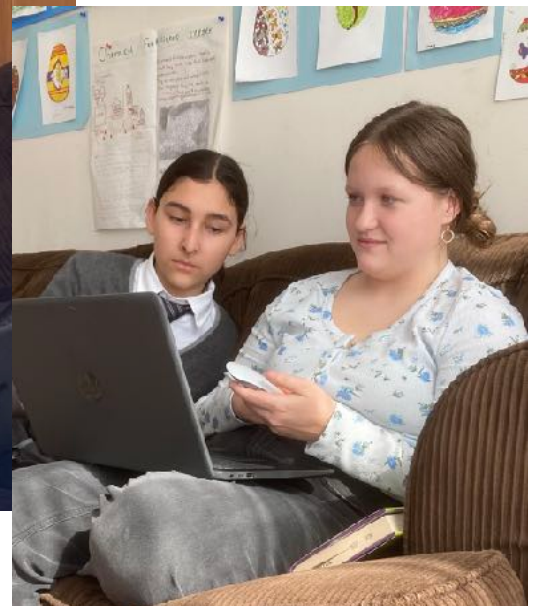
Older Students working on ancient civilizations