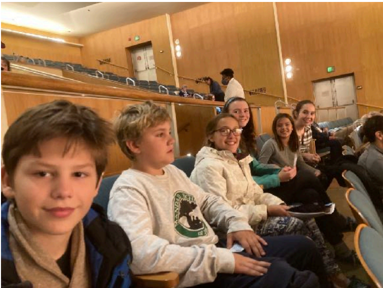
Students wait for the music to start at Kleinhans on Friday

In writing class I wrote about Allegany. In Allegany we played zombie tag and I was a tagger one time. The best part was my birthday. I turned ten. I also went to the beach and the water was very cold and also I saw a snake. The food was very nice and I loved making your own pizza. It was a good time at allegany! The end.