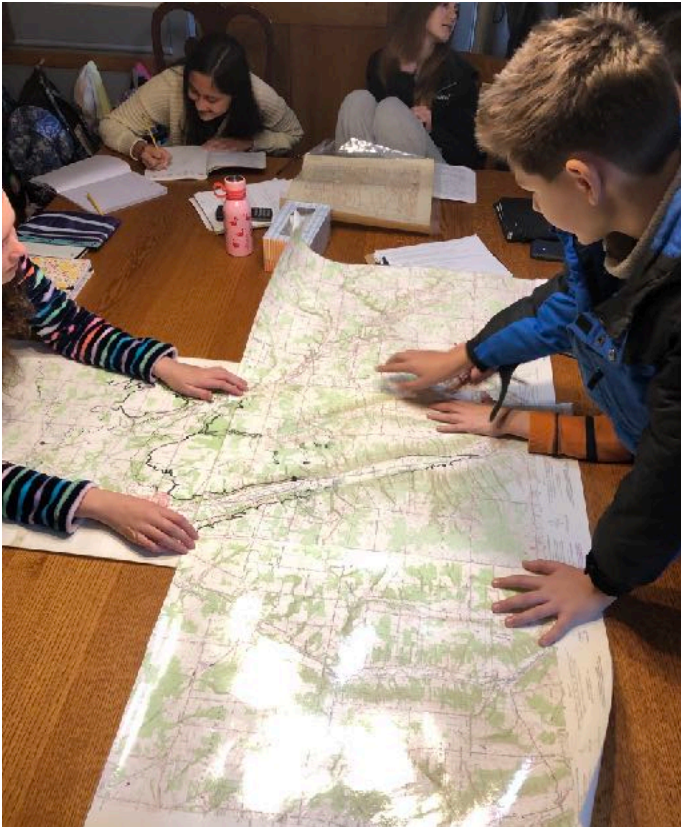
working on topography in Earth Science

In math I am learning to add fractions together. I love math because it makes me think about it and I know a lot, so it is easy. But these past days, adding fractions is challenging for me. Here is an example: \frac{1}{2} + \frac{11}{8} = 1 \frac{14}{16}