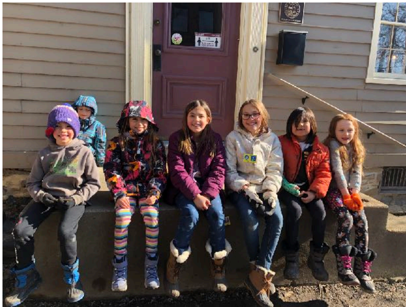
Friends sitting in the sun at rec! 🌞