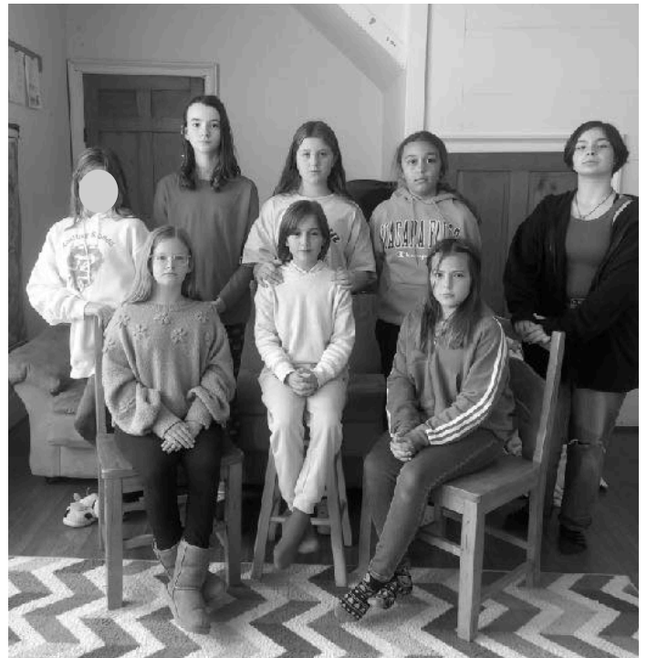
A family photo, circa 2023