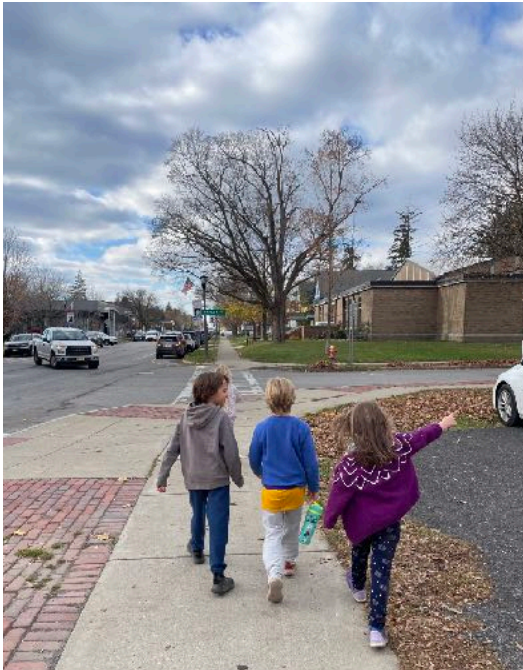
Our weekly trip to the library