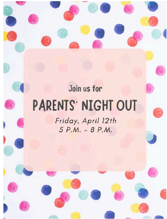
Register on our website! Ages 4 - 10, all are welcome! Dinner included.