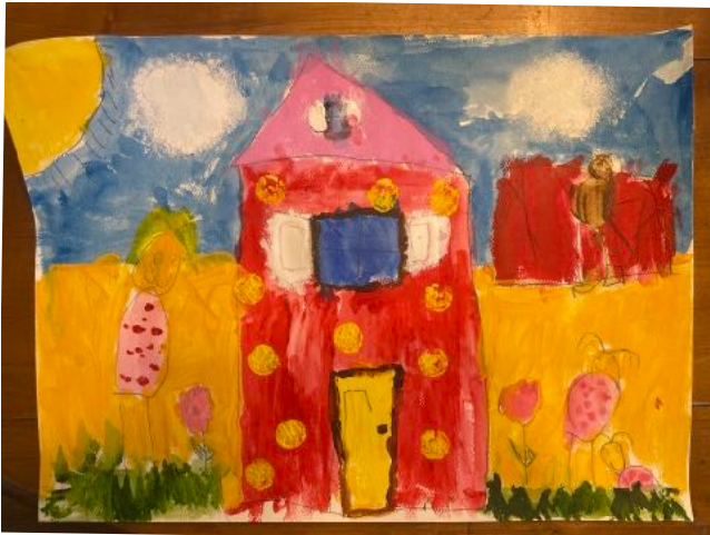
Artwork by Hazel

In art class we are putting happiness on paper and we need a painter that inspires us. Some people are doing things that make them happy like cats, people, etc. The younger kids are painting their houses and family. I am painting with watercolors of yellow flowers on a rainy day with puddles. By Elena