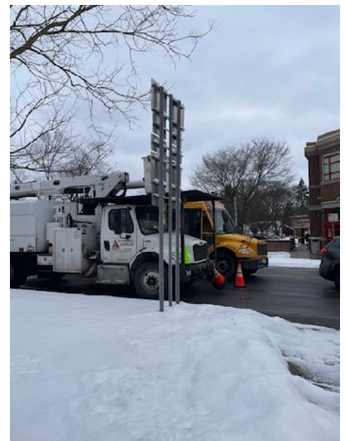
East Aurora Bus had to stop behind the trucks.

village and town board. I also sent it to some of the activists in East Aurora. Most of the time I am teaching my students, but sometimes they teach me. Juniper taught me that I should speak up when something isn't right."