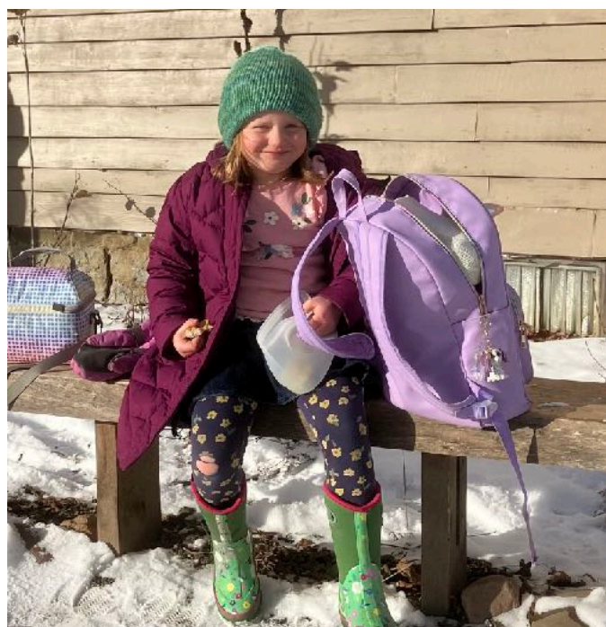
A sunny afternoon at the bus stop