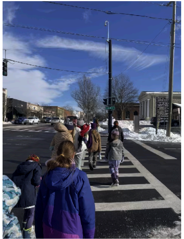
Sunny, chilly walk today coming back from the Boys and Girls Club