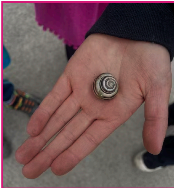
A snail we found on our walk to the library